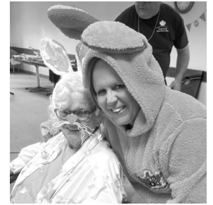
The Spring Brunch at Chardon Senior Center was filled with fun and friendship! Don't miss out on our next social event! It's a great way to get out and socialize with others!